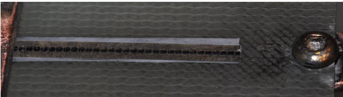
Figure 4 – Sample 2 after all three tests, with all buttons intact.