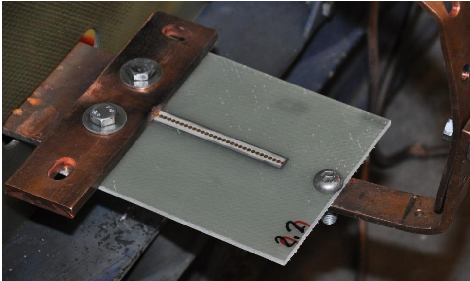
Figure 1 – Test sample 1 installed to the generator, 10 cm diverter strips section attached on a glass fibre panel with 1-inch gap in one end.